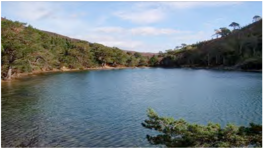
Fig. 2 – Green Lochan

1. The application site is located at the Lochan Uaine (Green Lochan) in the Glenmore Forest Park. It comprises an area of Scots Pine woodland on the banks of the Lochan containing sections of informal path and several viewpoints. A number of existing formal path networks are present in the vicinity including waymarked routes to Glenmore, Ryvoan and Abernethy (Core Path LBS127 – Glenmore to Nethy Bridge via Ryvoan). The site is within a series of designations including the NNR, NSA, SAC, SPA and SSSI.