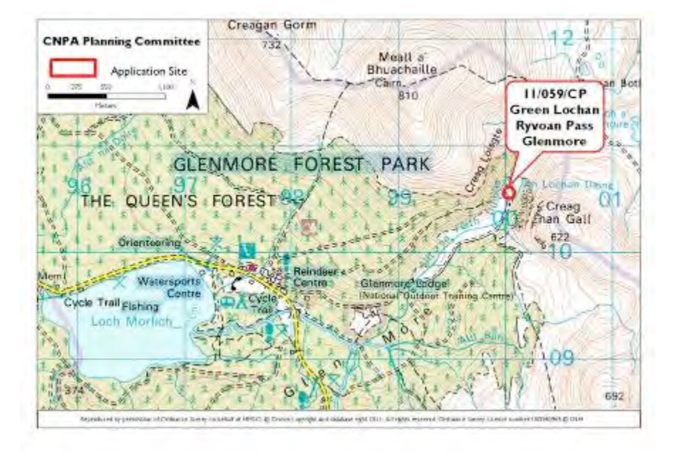
Fig. I - Location Plan