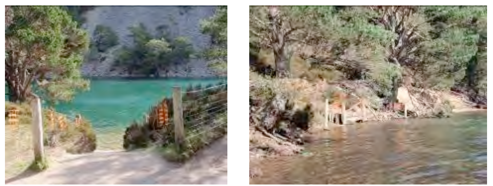
Fig. 3 & 4 - Existing access steps to water's edge

2. Planning permission is sought to formalise a section of existing informal 'desire-line' path, upgrade steps down to the water's edge and construct a timber viewing platform overlooking the Green Lochan. The proposed allabilities pathway would be a total of 60.0 metres in length, with a typical 2.0 metre path width, and be formed with two sections to allow for access to both a viewing area and down to the Lochan (via a meandering section with a series of steps replacing the existing 'hazardous' steps). The viewing area would be constructed to be an organic shape and formed with oak branch rails, based on a 'blank and beam' platform.